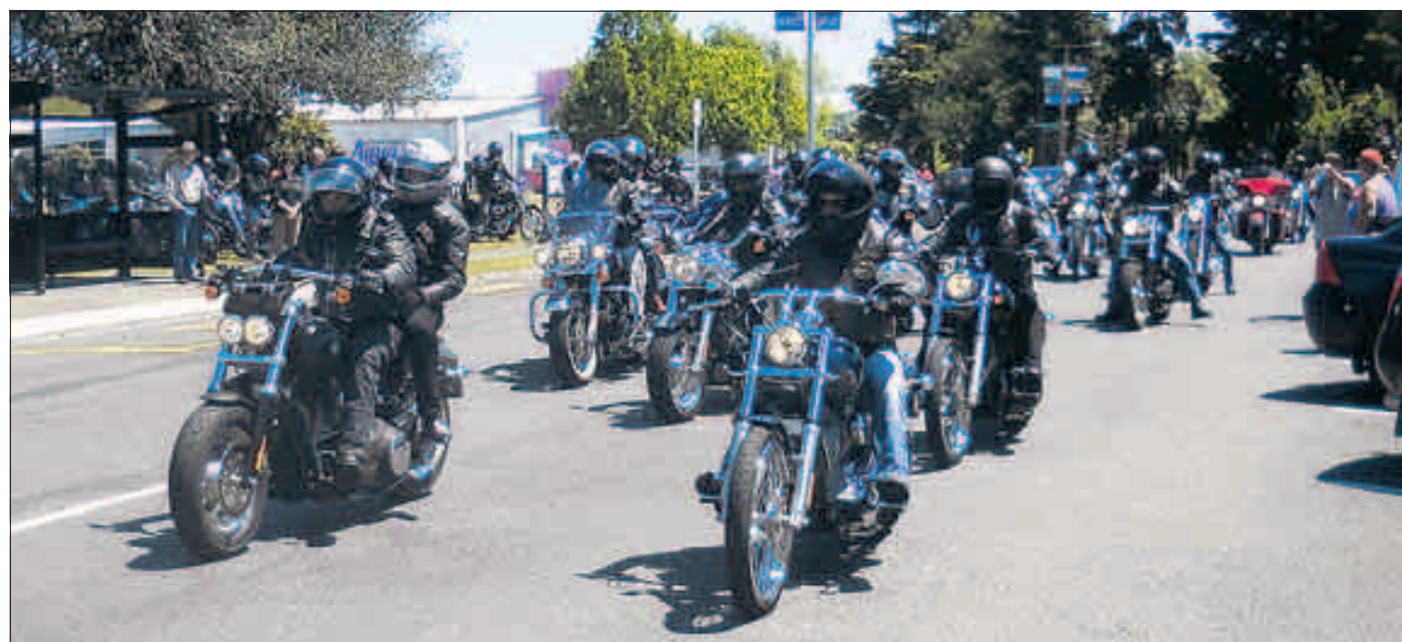
(BELOW) THEY'RE OFF: Poker Run participants head for the next stopover on Sunday's run — lunch at the Cambridge Cosmopolitan Club.