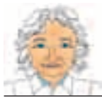
BY DEAN TAYLOR

The AA organises the Motoring Excellence Awards with the support of MARAC, The New Zealand Herald, Castrol New Zealand, Wag The Dog, EECA, and the NZ Motor Industry Training Organisation (Inc).