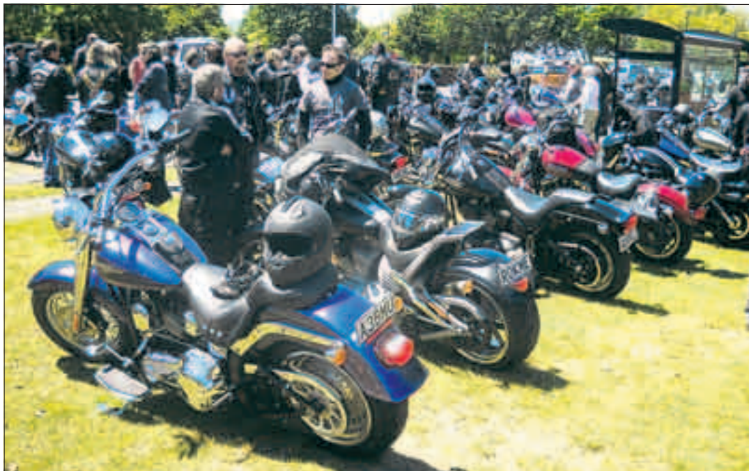
(RIGHT) PARK UP: Waikato/BOP H.O.G. Chapter members enjoy some Te Awamutu sunshine during Sunday's stopover.

To top it off the best poker hands win prizes valued at $1750 from sponsors Road & Sports Motorcycles.