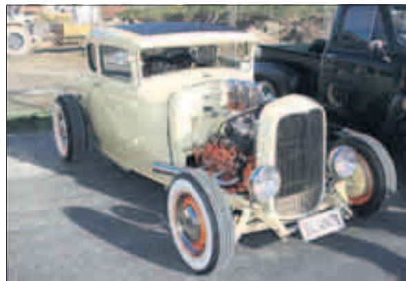
31: Very cool blown flathead V8.