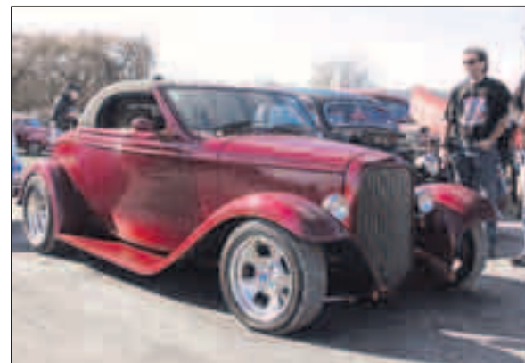
32: Very desirable 351ci V8 Cabriolet.