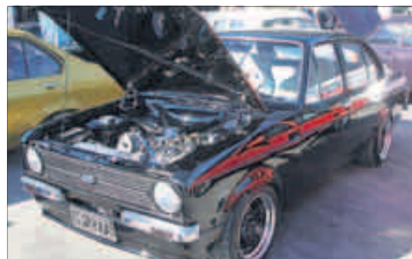
GREAT effort by a young guy on this '76 Escort. I gave it my vote.