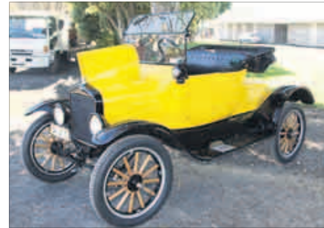
THAT'S what started it all. The only Model T there — and it won Sponsor's Choice. I think I heard the owner say he spent over 50 years on the restoration.