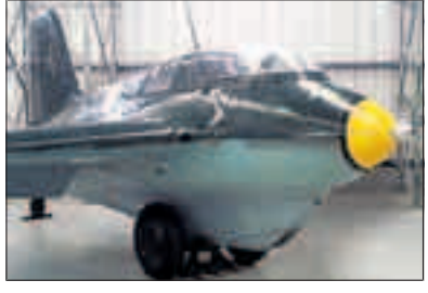
WAR MACHINES: Vulcan (V for nuclear capable apparently) looks the part, but that German thing at left, how did it even fly?

There is plenty to see and do, including getting on board a Concorde, getting up close to war planes from around the world and having a (virtual) go at flying a Zeppelin.