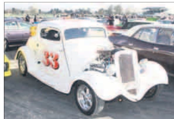
33: Very retro rod 289ci V8 Coupe.