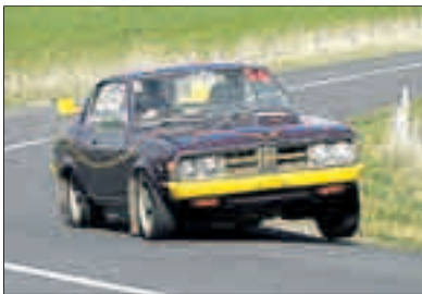
HAMILTON Car Club's Ngutunui Hill Climb.

"The format will involve two qualifying weekends in each island, with one day on tarmac and one on gravel with the final to be held by the end of